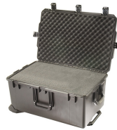
iM2975-X0001 With Foam