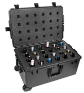
WINE-24B 24-Bottle Wine