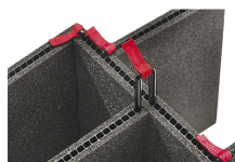
1615TP-KIT TrekPak Case Divider Kit