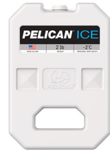
PI-2LB 2lb Ice Pack

Pelican 23215 Early Ave • Torrance, CA 90505 USA • Phone: (310) 326-4700 • (800) 473-5422 • Fax: (310) 326-3311 sales@pelican.com • www.pelican.com