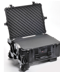
1610MWF With Foam