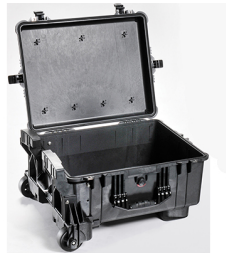
1610MNF No Foam