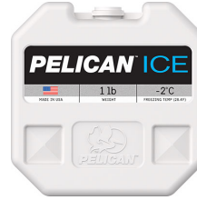
PI-1LB 1lb Ice Pack