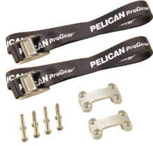
TDKIT Tie Down Kit