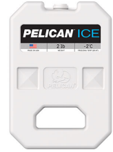
PI-2LB 2lb Ice Pack