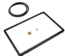
1520PF Special Application Panel Frame