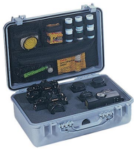
1508 Photographer's Lid Organizer