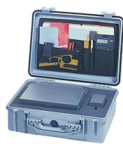
1509 Lid Organizer