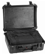
1526 With Convertible Travel Bag