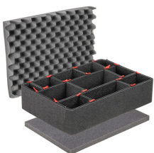
1520TPKIT TrekPak Case Divider Kit