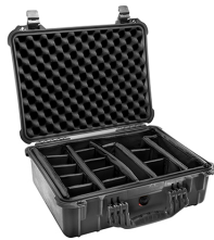
1524 With Padded Dividers