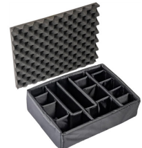
1525 Padded Divider Set