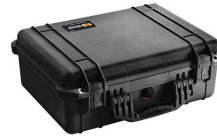
1520NF No Foam