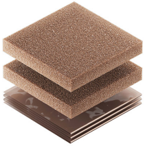
1500CI Corrosion Intercept Kit