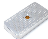
1500D Desiccant Silica Gel