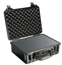
1520WF With Foam