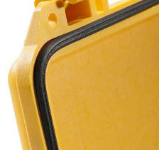
1703 Replacement O-ring