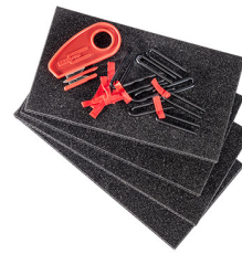
1506TPKIT TrekPak Case Divider Kit