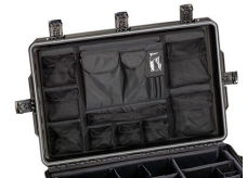
iM29XX-UTILITYORG Utility Organizer