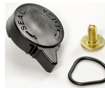
iM-VALVE-M-B Manual Purge Valve