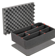
iM2400TPKIT TrekPak Case Divider Kit