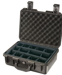
iM2200-X0002 With Padded Dividers