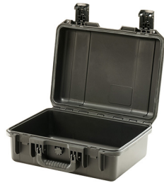
iM2200-X0000 No Foam