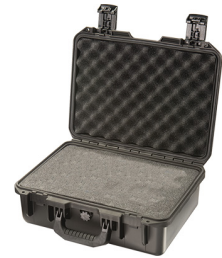
iM2200-X0001 With Foam