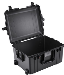
1607NF No Foam