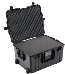
1607WF With Foam