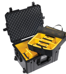
1607WD With Padded Dividers