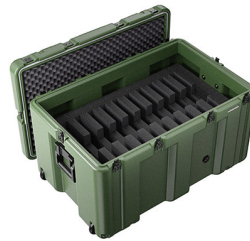
472-10-LAPTOP-S With Black Stainless Steel Hardware