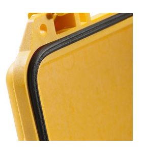
1073 Replacement O-ring