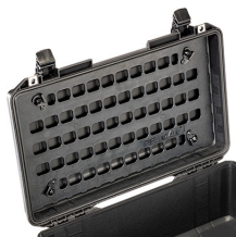
1535MP EZ-Click™ MOLLE Panel