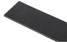
1120TPDIV Extra TrekPak Dividers