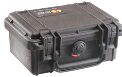
1120NF No Foam