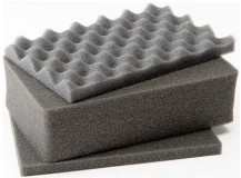
1121 3 pc. Replacement Foam Set