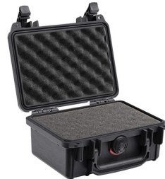
1120WF With Foam