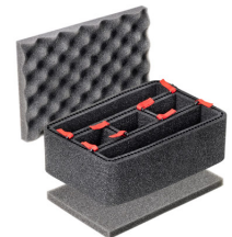
1120TPKIT TrekPak Case Divider Kit