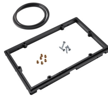
1120PF Special Application Panel Frame