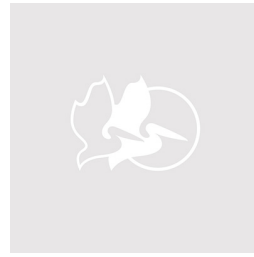
BG110TRAYBK Spacecase Tray