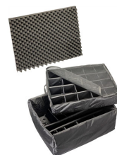
1695 Padded Divider Set