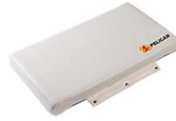
65-95QSEAT Seat Cushion - White