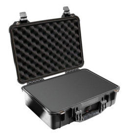
1500WF With Foam