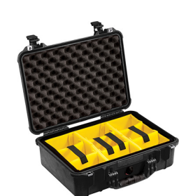
1504 With Padded Dividers