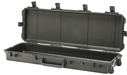
iM3200-X0000 No Foam