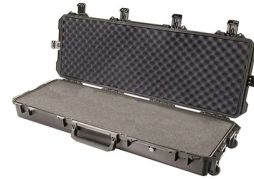
iM3200-X0001 With Foam