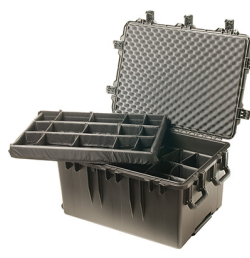
iM3075-X0002 With Padded Dividers