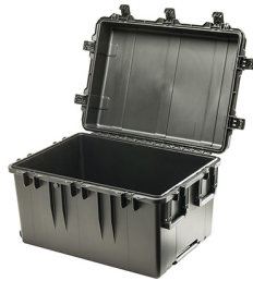
iM3075-X0000 No Foam