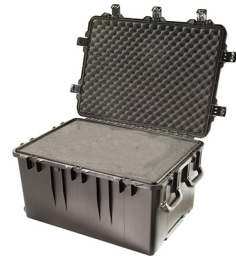
iM3075-X0001 With Foam