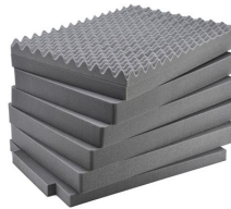
iM3075-FOAM 7 pc. Replacement Foam Set