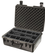
iM2600-X0002 With Padded Dividers