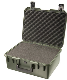
iM2450-X0001 With Foam