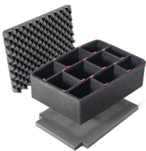
iM2450TPKIT TrekPak Case Divider Kit