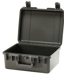
iM2450-X0000 No Foam