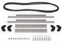
iM2450-BEZEL-LID Lid Bezel Kit