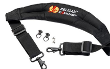
iM-STRAP-S-VER2 Padded Shoulder Strap