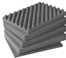
iM2450-FOAM 5 pc. Replacement Foam Set