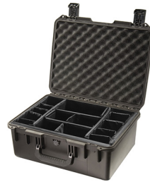
iM2450-X0002 With Padded Dividers