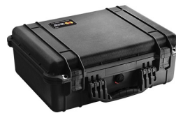
1520NF No Foam