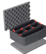
1150TPKIT TrekPak Case Divider Kit