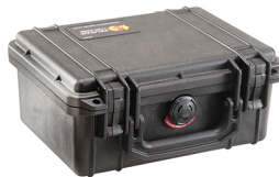
1150NF No Foam