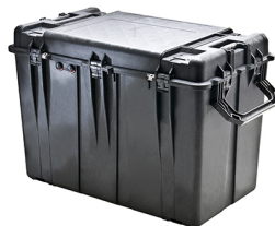
0500NF No Foam