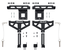
XBEDMT001C Cross-Bed Mount (Ford BoxLink)